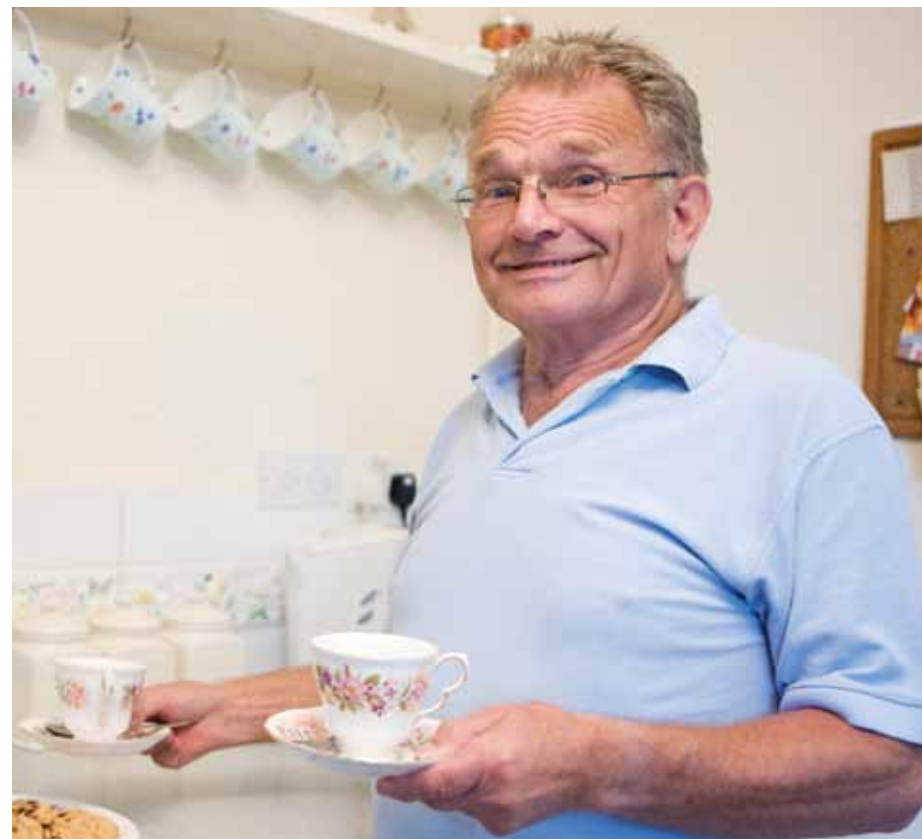
Posed by models