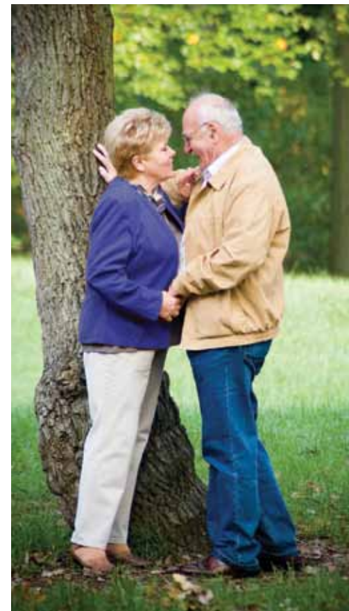
Posed by models

The information included in this guide comes from a comprehensive review of the literature, best practice examples from the UK and abroad and interviews with stakeholders involved in dementia care, policy and practice. At the back of this guide a resource pack provides further links to relevant literature, policies and guidelines.